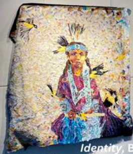
Identity, Blair Treuer (2023)

1800 West Old Shakopee Road Bloomington Center for the Arts 2nd Floor